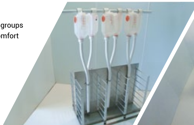
Drop feed station