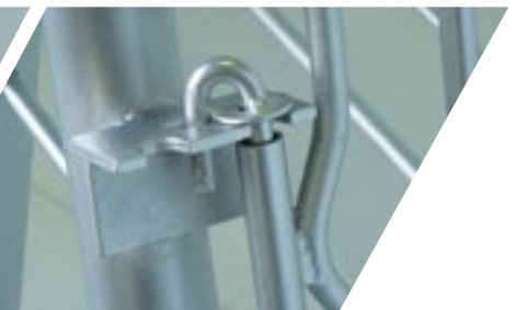
Quick pin gestation stall