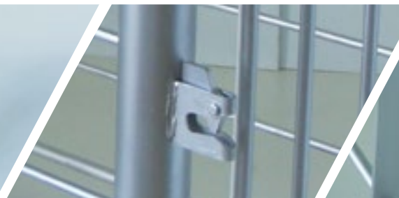
Slam latch gestation stall (no pins)