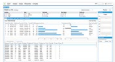
Group Detail View

Because Visipork ™ is hosted "in the cloud," new features, updates and enhancements are installed automatically, at no cost to you.