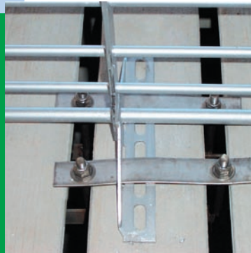
Stainless Steel Foot Straps and T-bolts