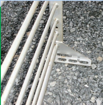
Stainless Steel Feet